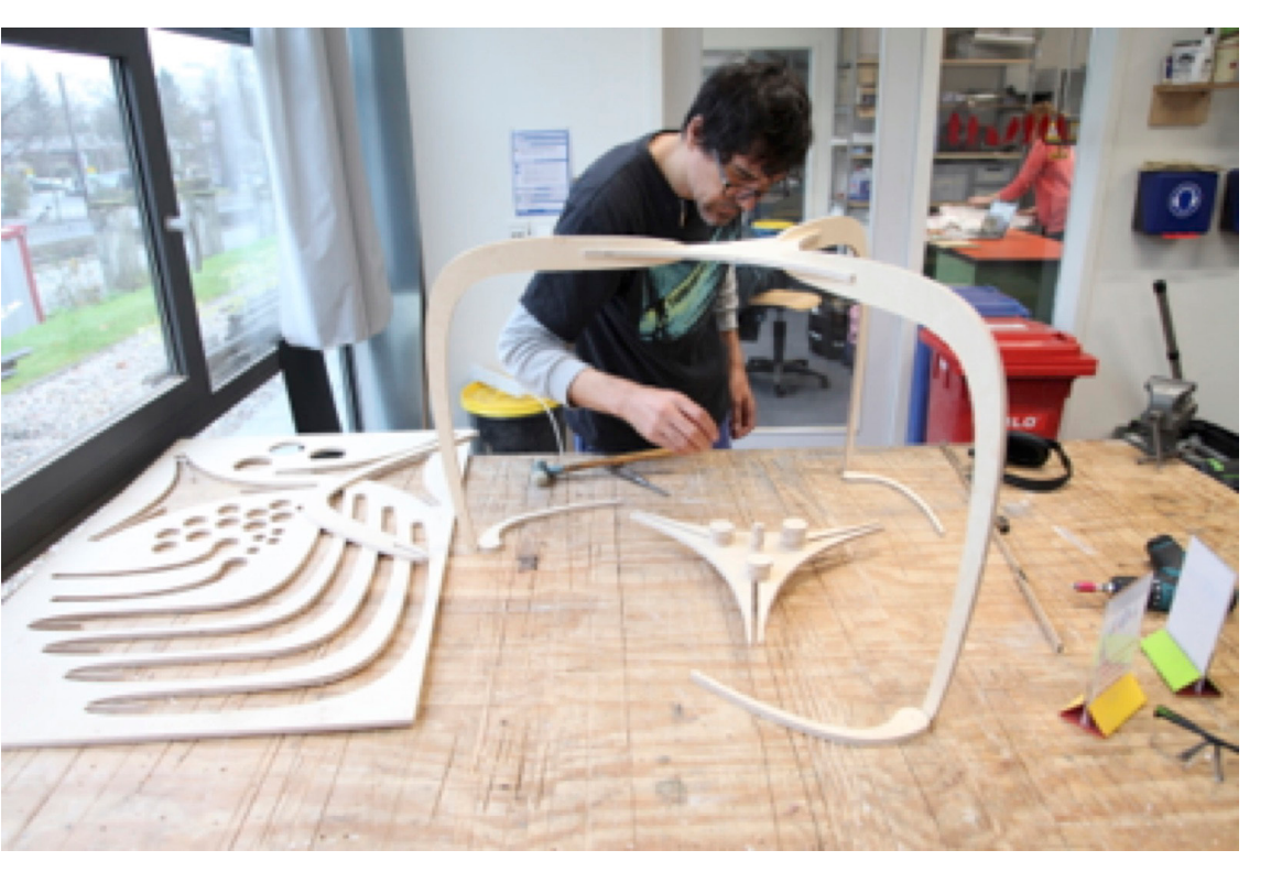
Fig 2. The making of Conception-Adargas at FAB LAB, Berlin-Treptow

Sideral therefore seeks to iconize this cosmic time through its levels of manifest. On the one hand is the galactic time that is carried down from its unknown origins in space, and on the other hand it carries the memory of its impact in time, or history on earth and its reception among an unexpecting community. The meteor's signals might have a message for the community, in its destined reception, just as mystics like Stockhausen were looking for a spiritual message in the music they received in their inspired moments<sup>3</sup>. Indeed, the original Tarahumara might have believed this in its systems of cosmic existence, even though there is no confirmation of such realities except in so far as the artists involved with Sideral imagined so. This was precisely why Armas, Esparza and Llermaly tried to synth the meteors magnetic impulses into musical symbols closely approximating the ritual music of the Tarahumara. Thus, as we said, that in its final moments, this installation, incorporating an animistic celestial object, sensors and navigable arms, and signal-generated music all seemed to compose a uniquely unidentified object from outer space. The different levels of time and its vitalistic functions and connections appear to sync in with the object and weave a historically engaging, environmental, retrieving spiritual machine.