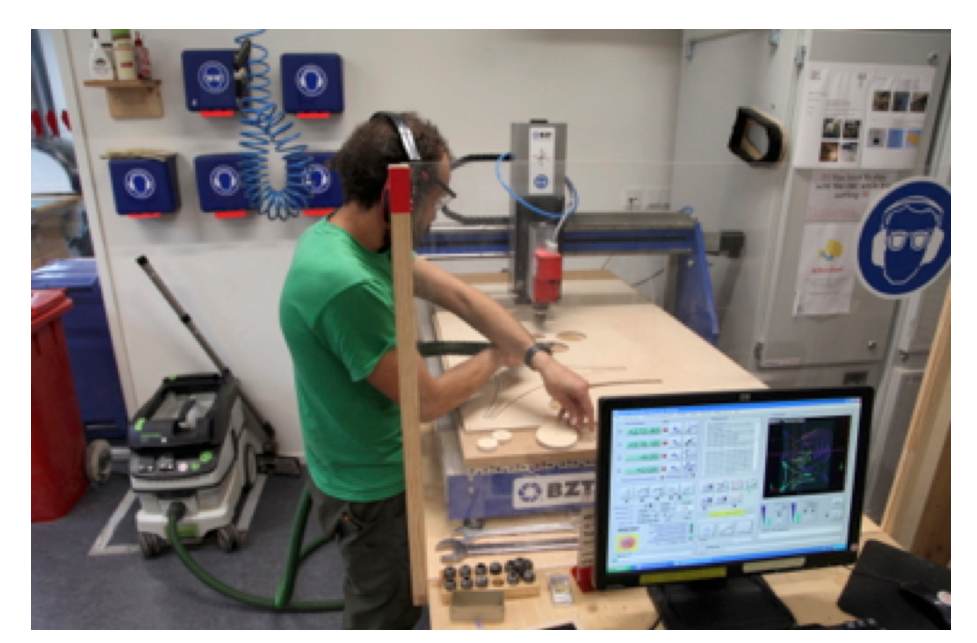
Fig 3. Buinding of a sensorial mantel that captures and replicates harmonies

FAB LAB became the space for executing a perfect electromechanical model that would serve as an extractor mantle for the meteor. Programming required for this step was again not complex, as the rotator mantel had to adjust itself to the rollers that traversed the meteor's body. The aesthetics of the mantel is again reminiscent of an object from space, like an R2D2 contraption. There is that still, subdued humor in Conception-Adargas that marks every Armas and Esparza project.