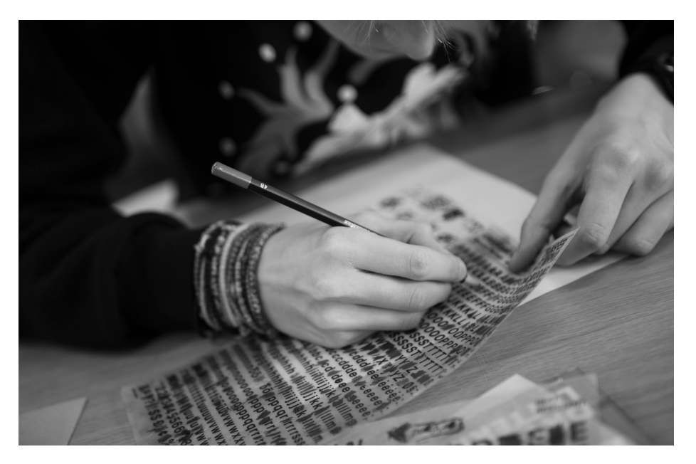
Fig 1. Inside the Communication Design Studio using Letraset

This approach promoted experiential learning experiences, that according to Kolb and Kolb (2019), are best conceived as processes, and not as outcomes. In this sense, the interactive design process included sequence, multiples, analysis, quick-fire prototyping, synthesis and reflection (Kampen 2020), scaffolded across a four-week period. Fortunately, this vital first iterative output was developed in studio on campus pre-pandemic, before a state of emergency was declared on the 25th of March and our entire nation went into self-isolation.