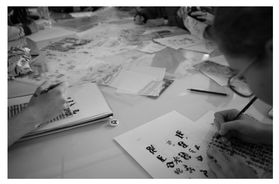
Fig 4. Year One students working on campus in the Communication Design Studio

As anticipated, students were eager to return to the physical, face-toface setting of their on-campus design studio community and to gain access to the technical facilities to print, make design artefacts and engage with other live sensory experiences. Exhausted staff emerged cognisant of the need to integrate experiential learning theory with core curriculum activities to identify and apply a wider range of strategies for engagement, collaborative learning, peer to peer interactions and participation (Figure 4).