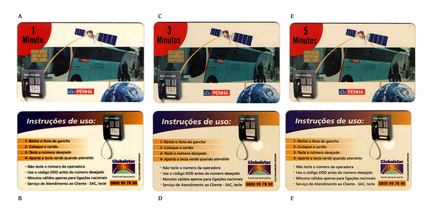
Fig 3. Specific phonecards (front and respective backside) used in payphones of Empresa de Ônibus Nossa Senhora da Penha S.A. model Classis

The study was carried out in an office where a collection of phonecards and other collectible items is kept in Pangkalan Kerinci, Riau, Indonesia ( 0^{\circ}20' N × 101°51' E). The specific phonecards used in payphones of Viação Itapemirim S.A. and Empresa de Ônibus Nossa Senhora da Penha S.A. buses were obtained for their description. The front and back of each card was scanned (Figures 3A-3L).