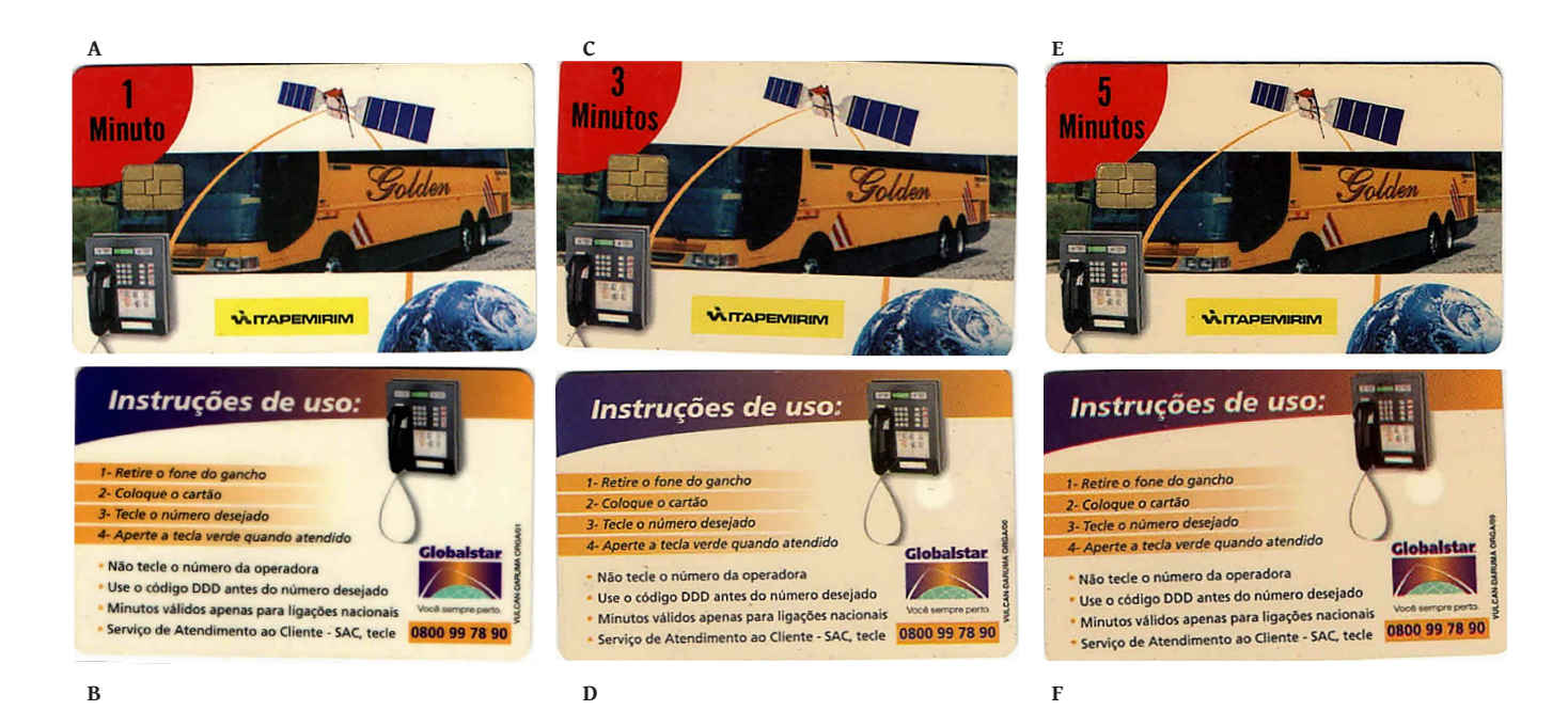
Fig 4. Specific phonecards (front and respective backside) used in payphones of Viação Itapemirim S.A. transport company buses, model Golden.

The phonecard characteristics were identified including card catalog number, issue date and face value (expressed in phone-time). A brief description of the cards was also made. In addition, the type of microchip module (CM) and number printed per card were identified following procedure described by TAVARES AND SILITONGA (2021b). The market evaluation (expressed in US$) of the mint and fine used cards in 2004 was also identified from the catalog published by PITARRESI (2004) (Table 1). The price of the cards (expressed in US$) as a collectible item in Brazil in July 2021 was also identified by consulting a professional phonecard collector (currency conversion from Brazilian real to American dollar was carried out on 17 July 2021) (Table 2).